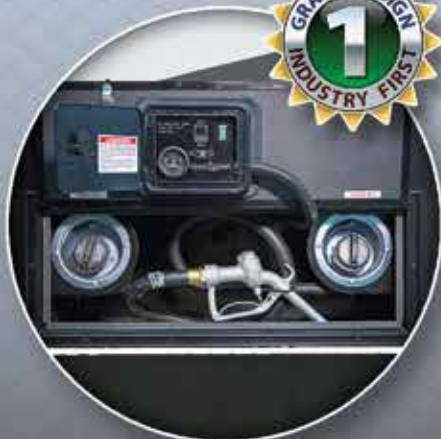
FULLY ENCLOSED FUEL CENTER Convenient. Consolidated. Secure.