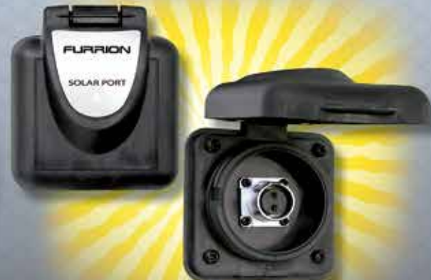
SOLAR PORT CHARGING INLET Momentum is solar charging panel friendly. Simple "plug and play" operation.