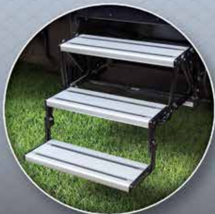
ALUMINUM ENTRY STEPS Easy to open and will not rust like traditional steel steps.